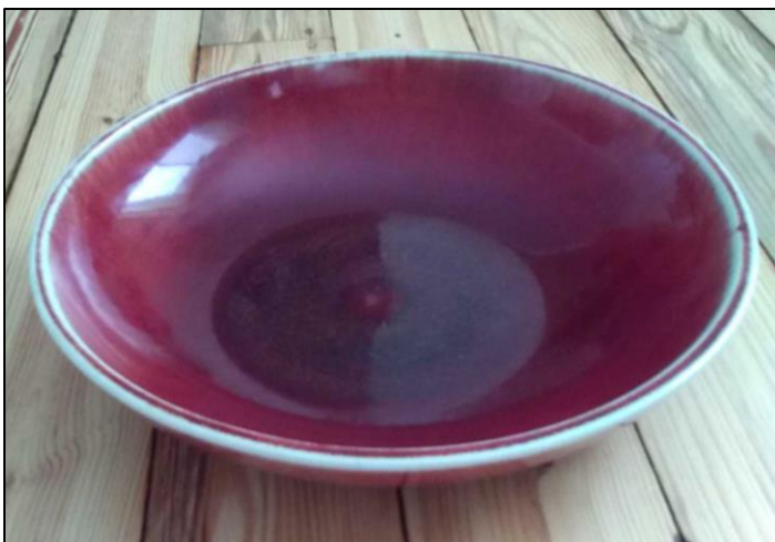
Figure 2 - Franciscan Ox-Blood Opium Bowl. Collection of the Grant Family.