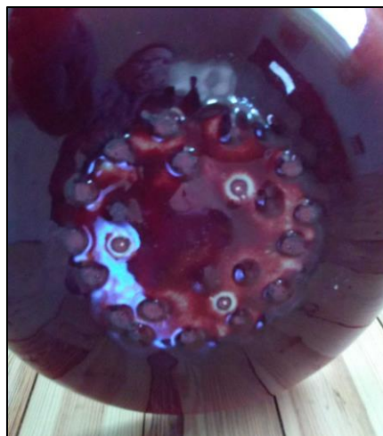
Figure 2 - Franciscan Ox-Blood Opium Bowl. Bottom of bowl. Collection of the Grant Family.