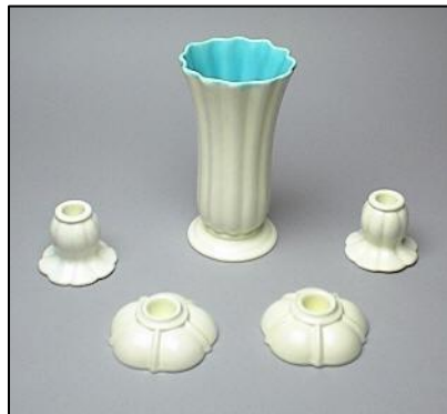
Figure 3 - Correctly identified, these are examples of Avalon Art Ware.