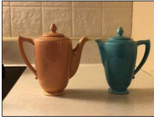
Figure 5 - On the left is the #556 Individual Coffee Pot in coral gloss. On the right is the #553 Hot Water Pot (AKA Hot Chocolate Pot) in glacial blue. The #556 was introduced in November 1937 and discontinued in January 1939. The #553 was introduced in August 1937 and discontinued in January 1939.

no entry for the #556 Individual Coffee Pot. The #556 Individual Coffee Pot was introduced in November 1937 and discontinued in January 1939. The #553 Hot Water Pot (AKA Hot Chocolate Pot) was introduced in August 1937 and discontinued in January 1939.