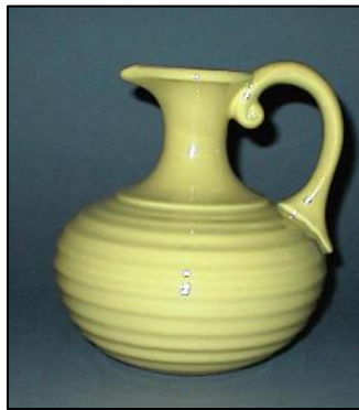
Figure 6 - Specials, S-7 Pitcher made for The General Paint Corporation.

The pitcher in the image on the bottom of the page 161 is the S-7 Pitcher in the Specials line. The S-7 pitcher is not in the Hotel Ware line. The S-7 pitcher was made in August of 1934 as a special order for the General Paint Corporation.