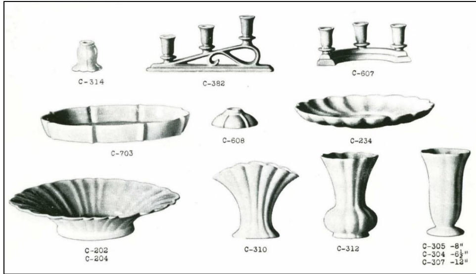
Figure 1 - Avalon Art Ware, factory price list image.